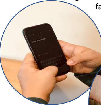
Pegwishtuk tah famille